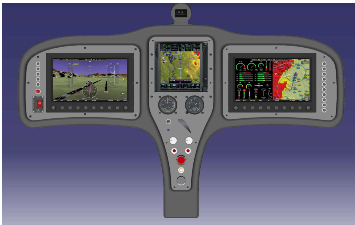
The avionics suite contains instruments from Dynon, Garmin and Air Avionics: With this extensive equipment, the REMOS GXiS is going to be certified as a LSA in Europe.

All images are free for publication with copyright note „REMOS AG“.