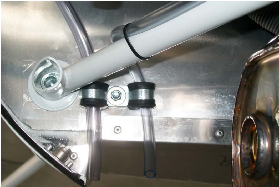
fig. 5 - adel clamp fixing the drainage hose at the firewall