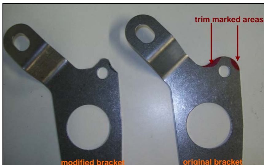
Fig. 2 - modification of bracket