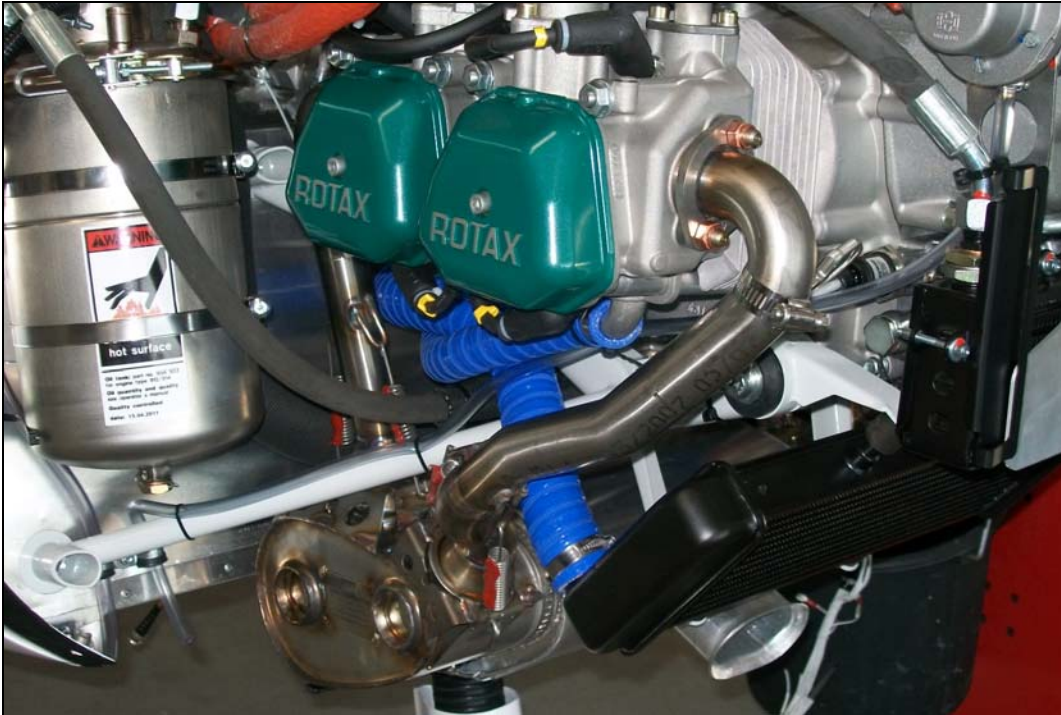
fig. 4 - routing of the drainage hose