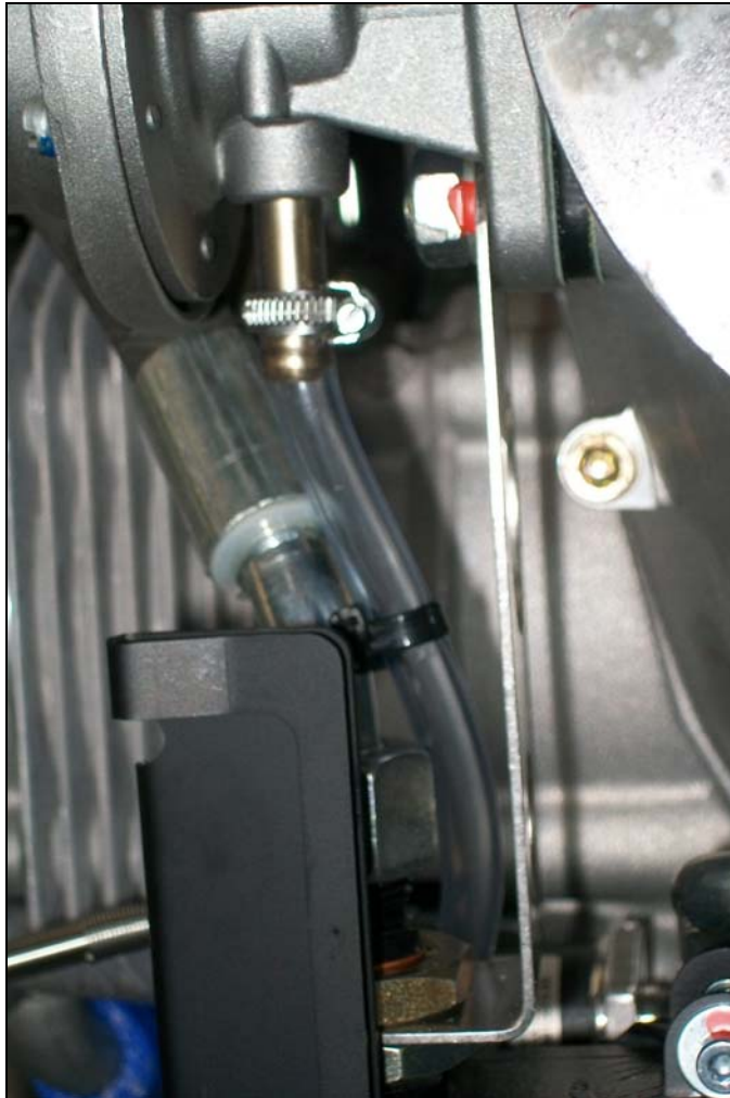
fig. 3 - attachment of the drainage hose to the fuel pump