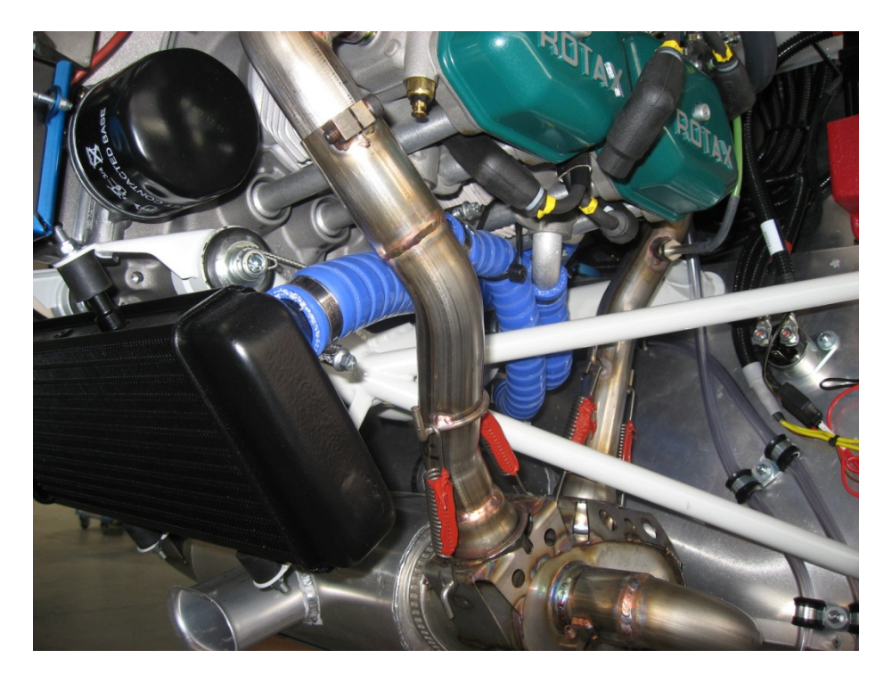
Figure 7 – Hoses from/to engine, detail view left-hand side