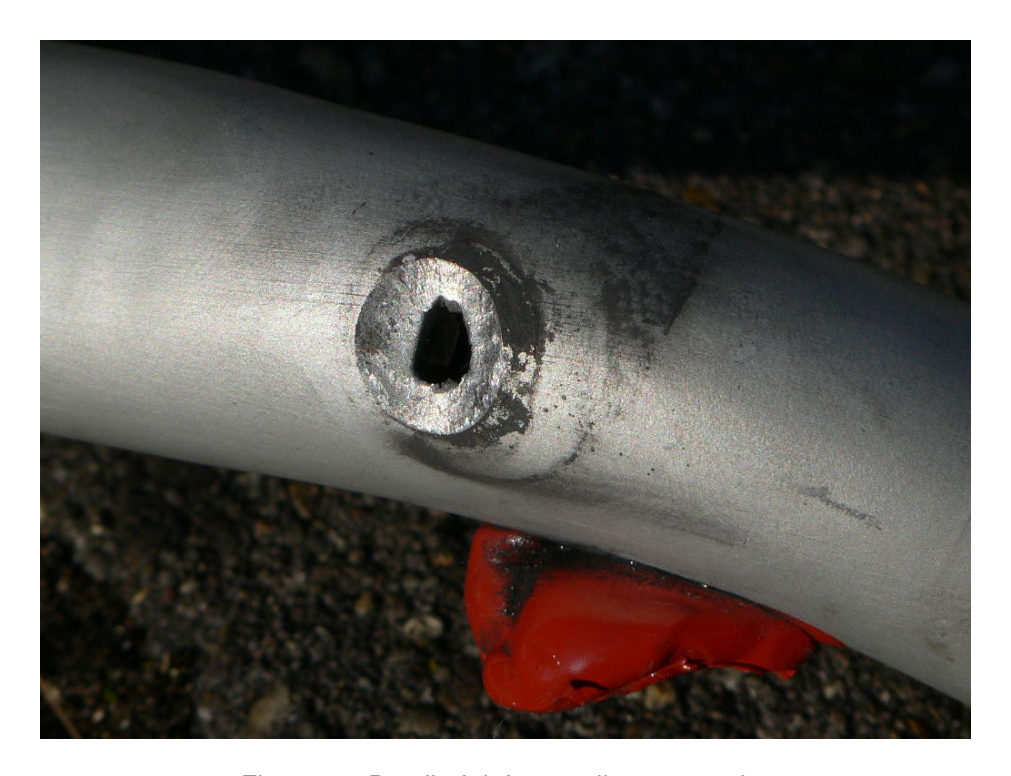
Figure 3 – Detail of defect cooling water tube