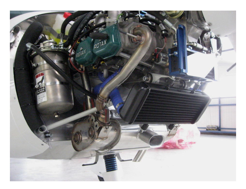
Figure 6 – Overview correct hoses from/to engine, right-hand side