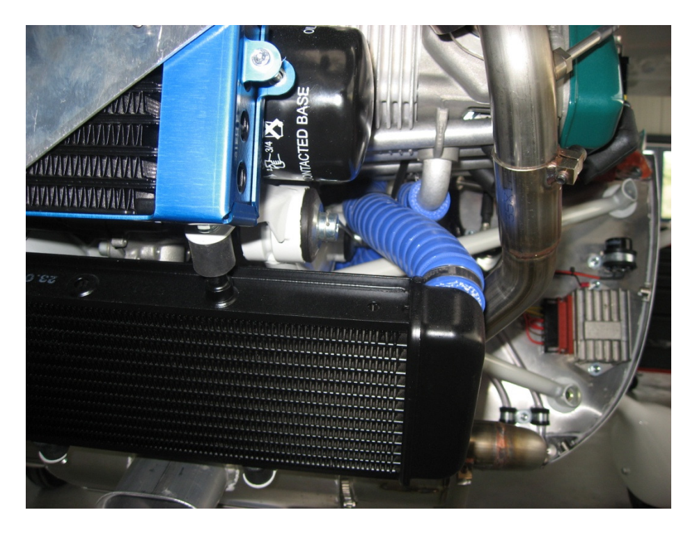
Figure 8 – Hoses from/to engine, detail view front-left