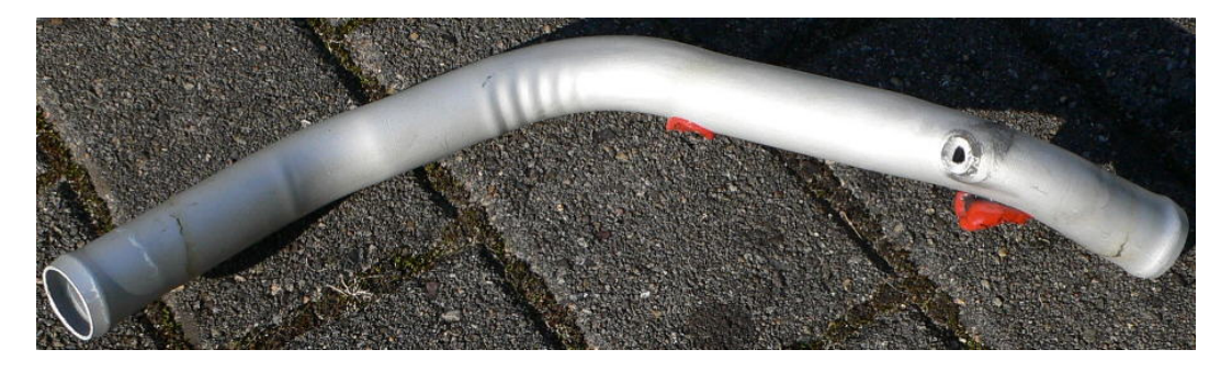
Figure 2 – Damaged cooling water tube