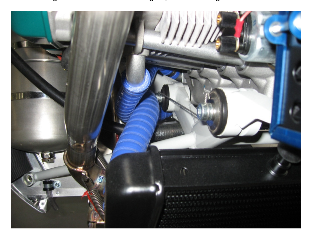
Figure 10 – Hoses from/to engine, detail view front-right