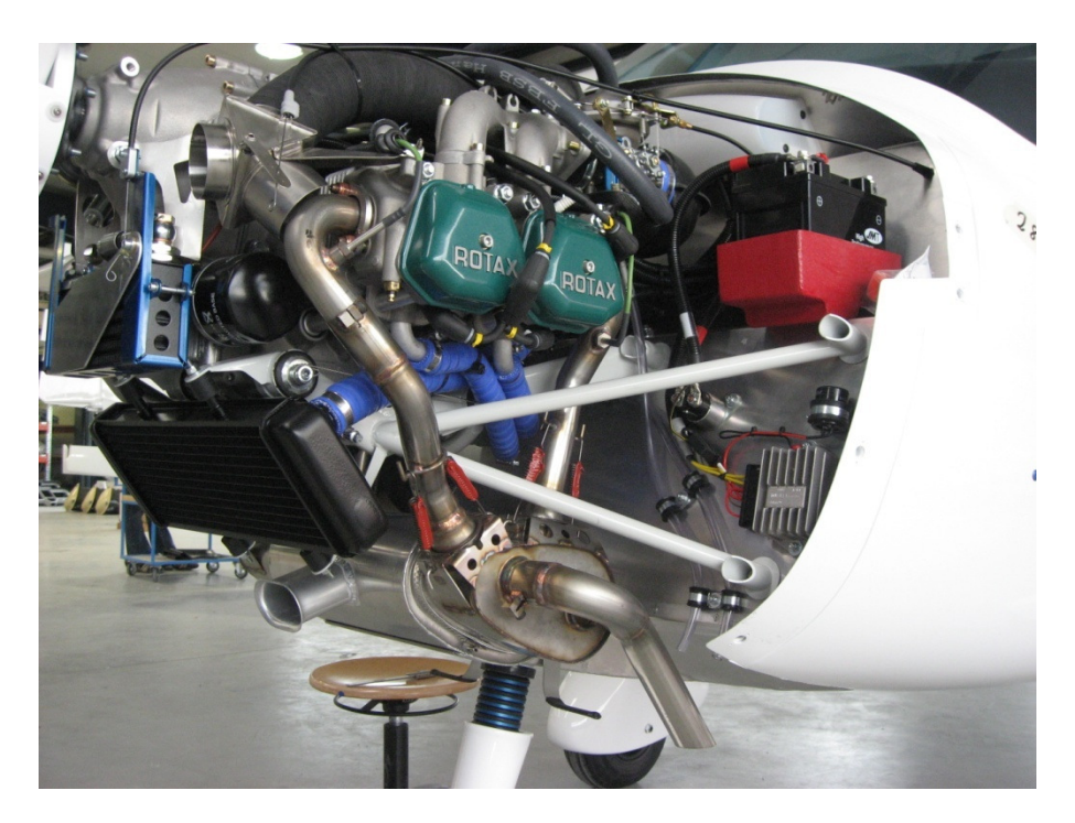
Figure 5 – Overview correct hoses from/to the engine, left-hand side