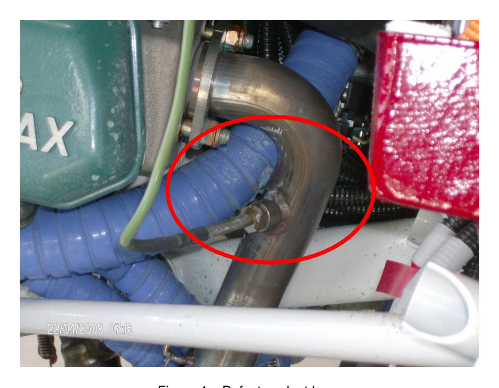
Figure 4 – Defect coolant hose