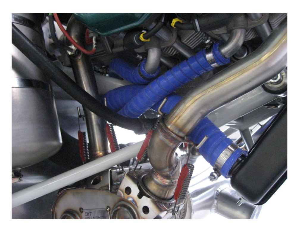
Figure 9 – Hoses from/to engine, detail view right-hand side